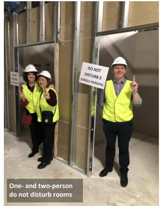
One- and two-person do not disturb rooms