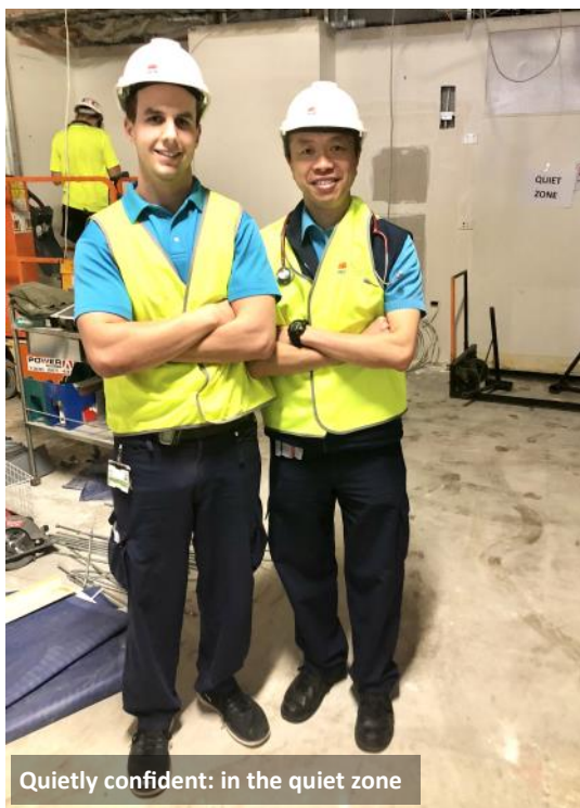
Quietly confident: in the quiet zone