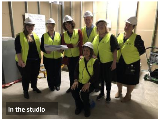
In the studio

The move-in date is yet to be confirmed, but early 2019 is currently the aim.