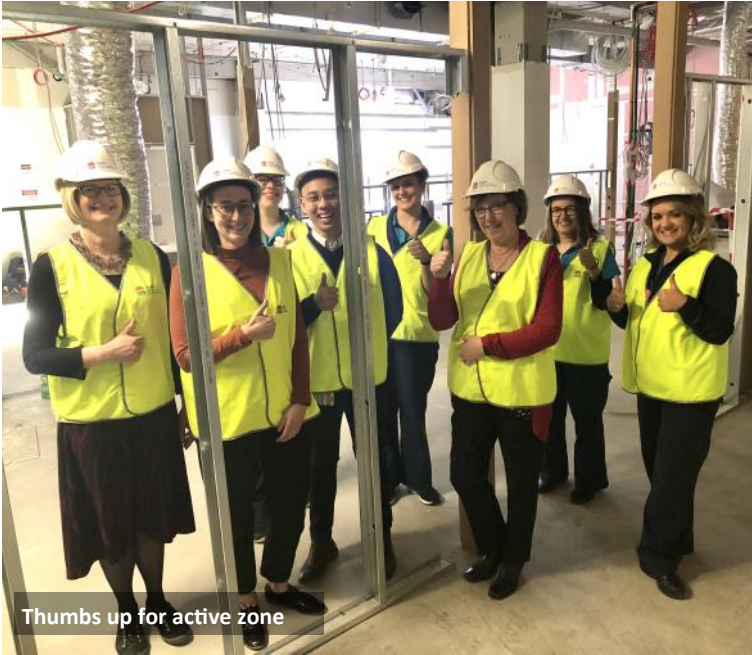
Thumbs up for active zone