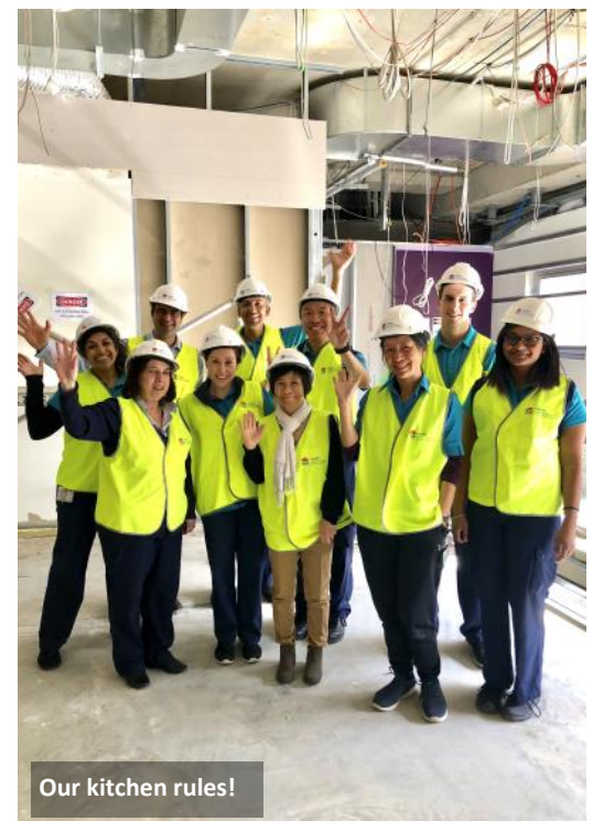
Our kitchen rules!