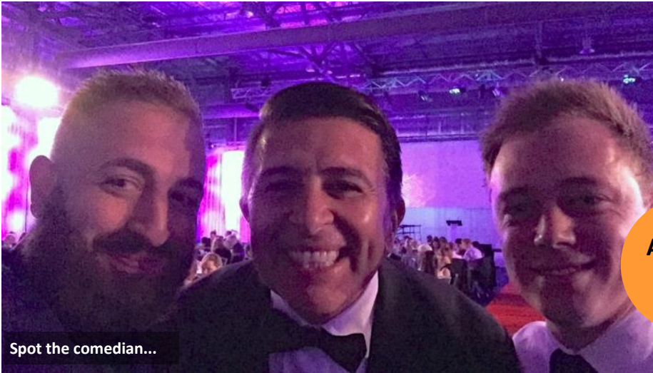
Spot the comedian...

NSW Health Awards Monday 31 October 2016