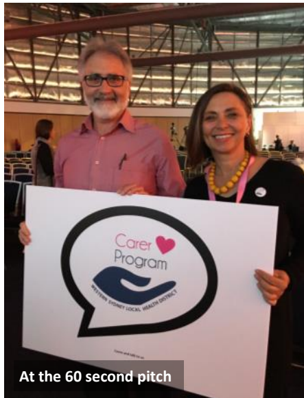
At the 60 second pitch